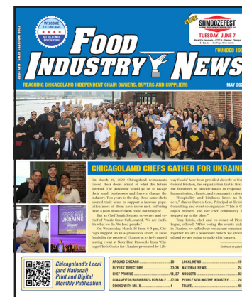
Monthly Print and Digital Trade Magazine