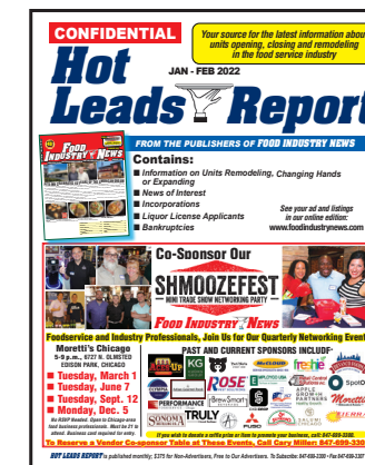
Monthly Report of New Openings and Qualified Sales Leads