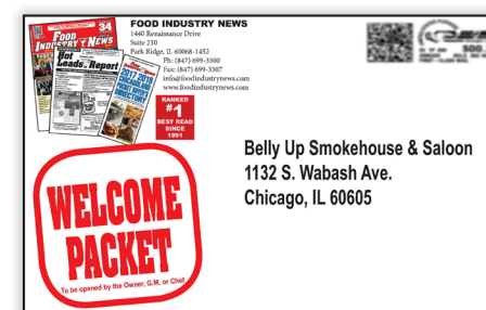
Mailing to New Owners and Established Locations