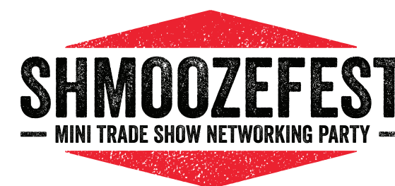
Quarterly Mini Trade Shows